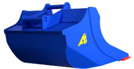
Rear view of a C30TR1